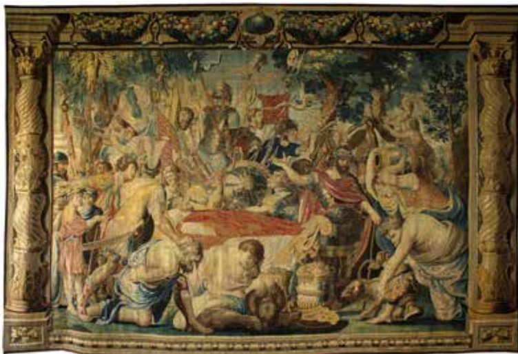
Funeral Obsequies of Decius Mus, Office of Public Works, Kilkenny Castle