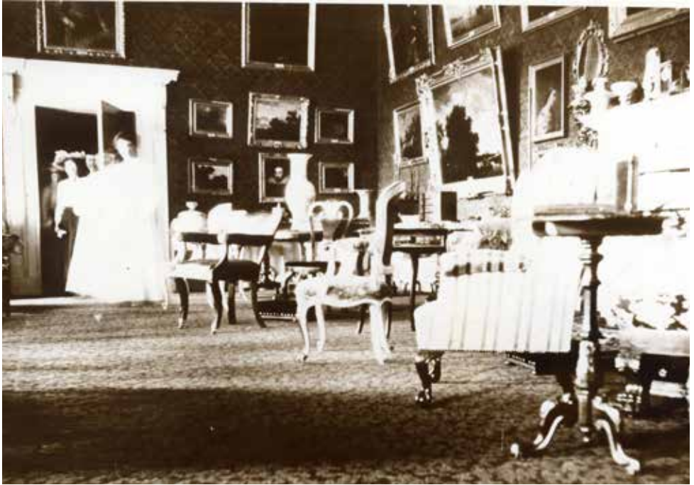
Drawing Room at Newbridge, c.1905